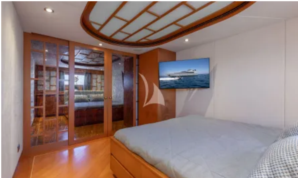
Office convertible to double cabin