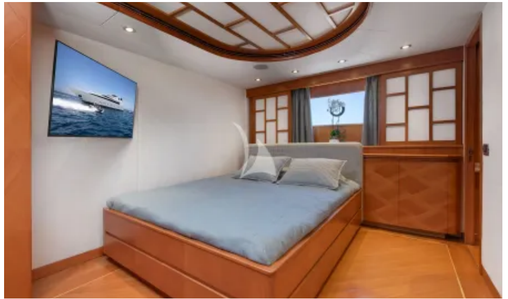
Office convertible to double cabin