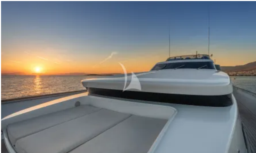
Fore deck at sunset